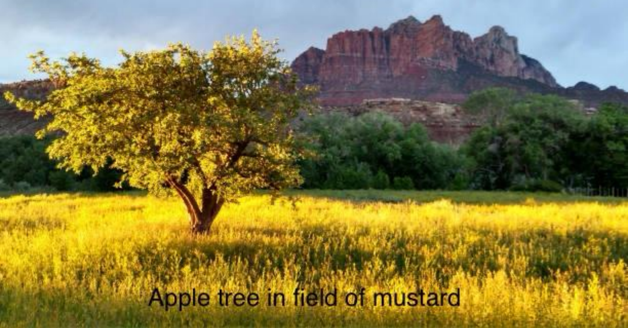
Apple tree in field of mustard