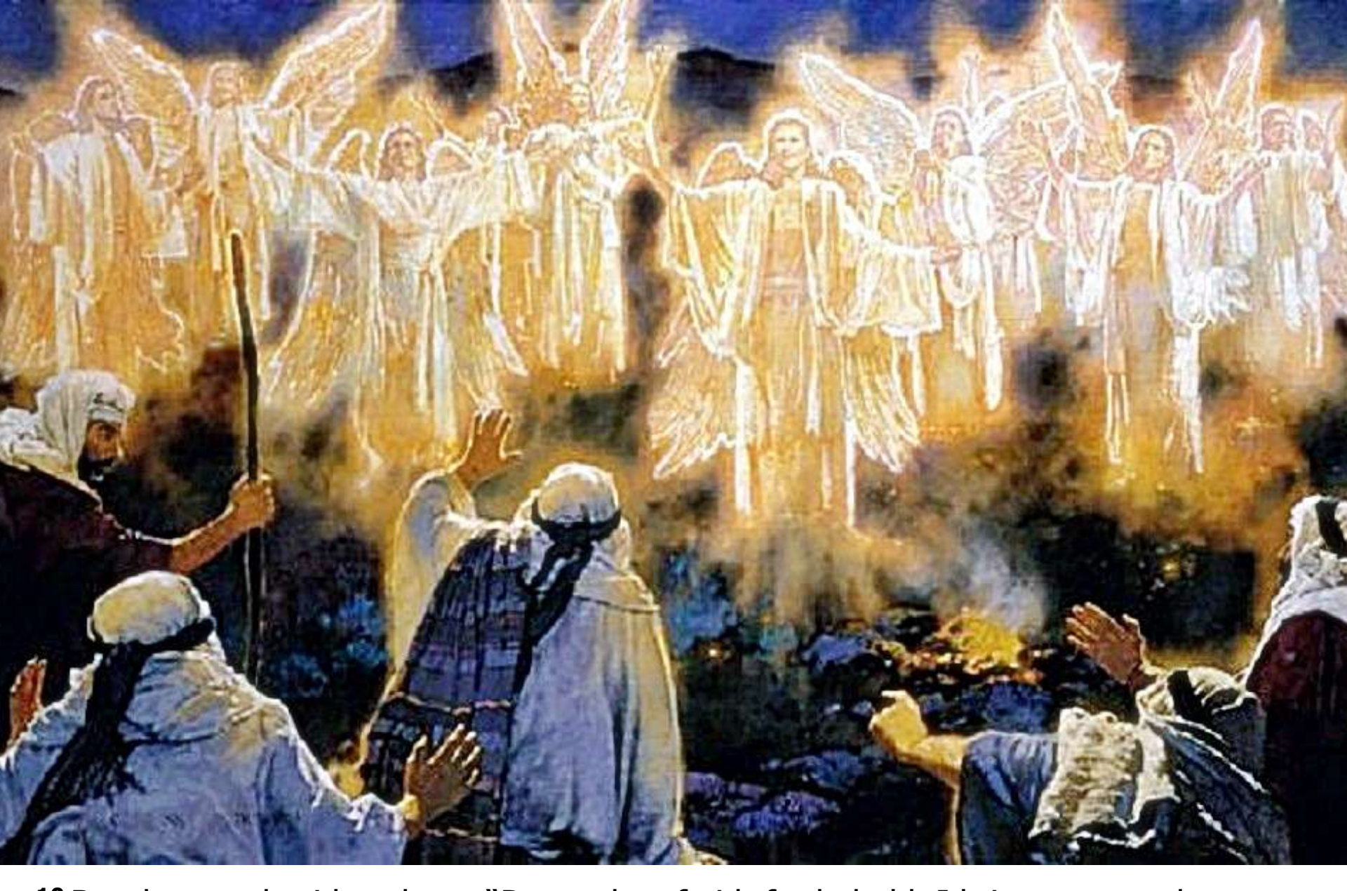
10 But the angel said to them, "Do not be afraid; for behold, I bring you good news of great joy which will be for <u>all the people</u>; 11 for today in the city of David there has been born for you a Savior, who is [e]Christ the Lord."